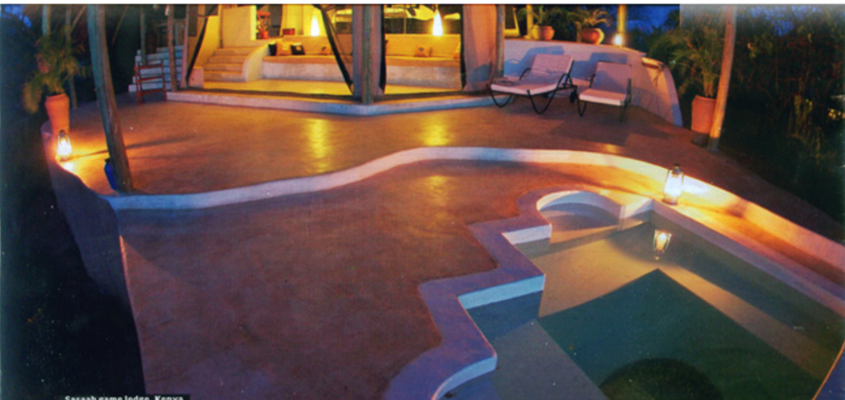
Sasaab game lodge, Kenya