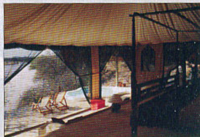
Each luxury 'tent' in Sasaab has concrete floors and thatched roofs, as well as fantastic views

although private dining in your room can also be arranged.